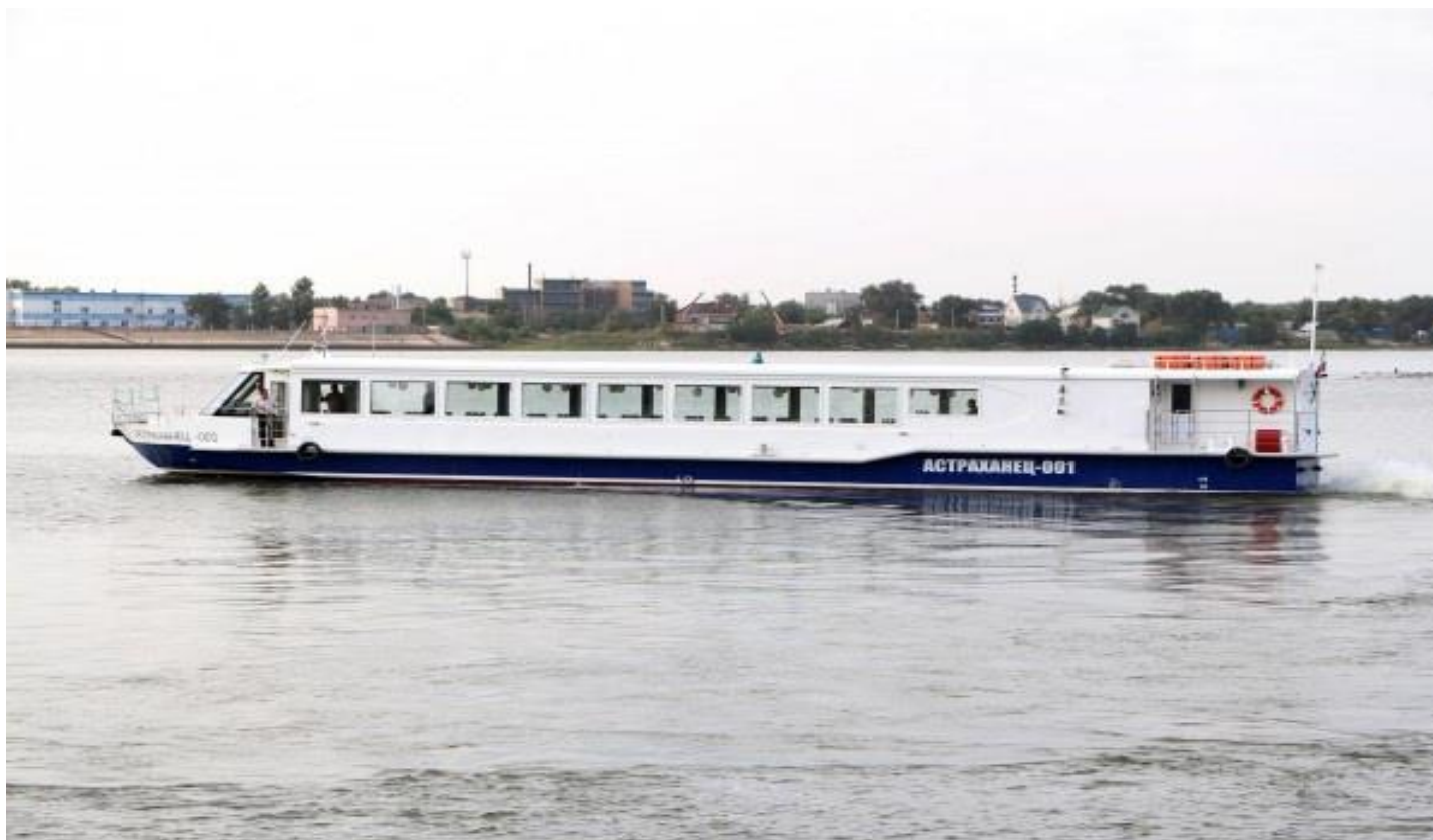
Passenger ship of 23020A Project

In 2014, a contract to build three passenger ships of 23020A Project for transfer into lease to State-owned enterprise of the Astrakhan region PATP No. 3 was signed with Moscow Shipbuilding and Ship Repair Yard, OJSC.